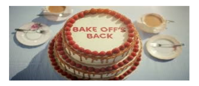
P.T.A. EASTER EVENT

Following our Easter Service for all parents and families, on the school playground, on Friday March 31st 9.30 a.m. we would love you to stay afterwards and support the P.T.A.'s Easter Bake-Off.