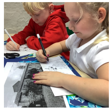
Children from Mrs Woods' Art class looking at and recreating some spectacular Van Gogh's Starry Night Art work...