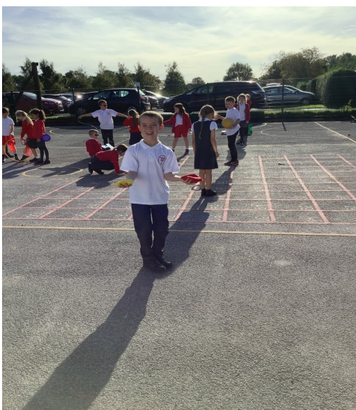
Some children doing science using various equipment and outdoor learning!