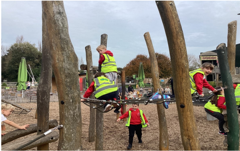
Busy Bees trip to Blackpool Zoo this week, combining learning and play!