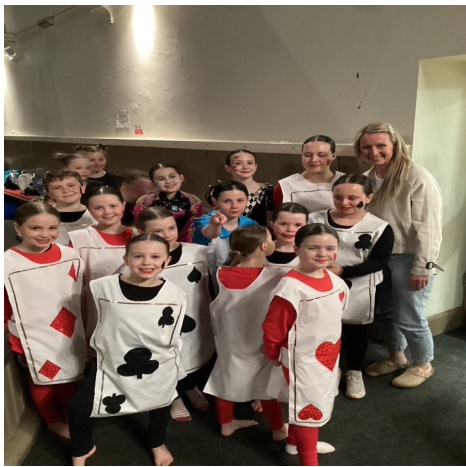
Dancing super stars...